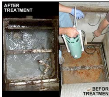
Grease Trap Before and After Hydrologix GRS Treatment

Hotel restaurant grease interceptors and grease traps are county or city mandated receptacles to contain the food waste liquids from kitchen drains, in particular problematic F.O.G. (fats, oils, grease). Although covered and periodically vacuum pumped by grease hauling companies, occasionally foul odors disturb staff and customers and unexpected overflows may occur. Local authorities across the USA charge hefty fines for overflows, since this grease trap wastewater if untreated, contains potentially harmful anaerobic organisms such as salmonella, as well as methane and hydrogen sulfide gases. The Hydrologix GRS's innovative aerobic treatment system hosts a proprietary blend of food grade microorganisms that multiply rapidly to continuously digest all potentially harmful matter. The result? These critters 'magically' transform the liquid waste into clear water!